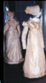
Collection of the Folkestone Museum, UK