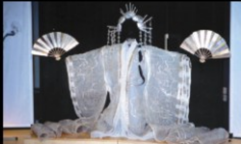
Collection of the Folkestone Museum, UK