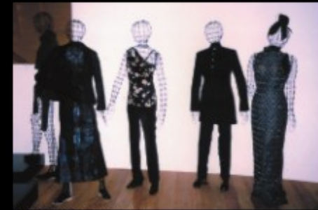
Collection of the Folkestone Museum, UK

As experienced display artists, we are happy to construct your special display at your venue. If you have any particular display problems we are also happy to discuss, consult and advise you or your staff.