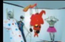
Collection of the Folkestone Museum, UK